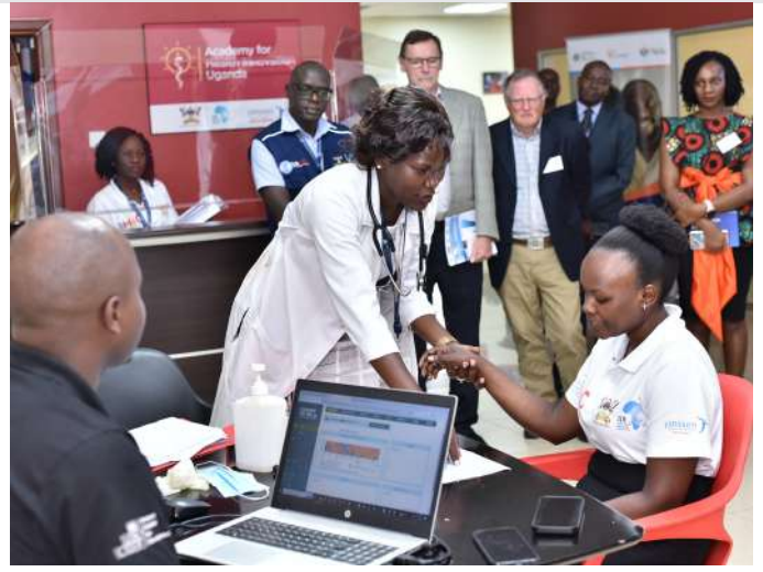
The Academy staff take guests through a role play at the IDI at 20 celebrations