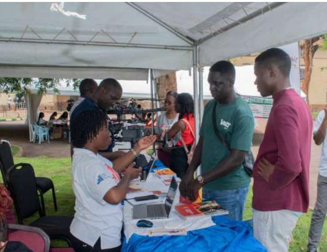
Students interact with the Academy tent at the Youth & Innovation Expo held at Makerere University