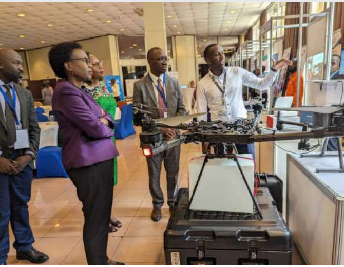
The Minister of Health Dr Ruth Aceng inspects the medical drones at Digital Health Conference